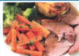
Roast gammon & gravy Yorkshire pudding, roast potatoes, carrots & honey roast parsnips