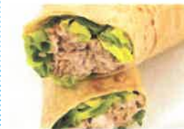
Tortilla wrap with cheese salad, ham salad or tuna mayonnaise, carrot & cucumber sticks