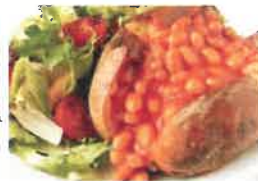
Jacket potatoes with cheese, beans or tuna mixed salad & coleslaw