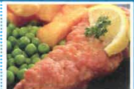
MSC Fish portion tomato ketchup, oven chips peas & sweetcorn