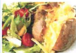
Jacket potatoes with cheese, beans or tuna mixed salad & coleslaw