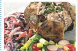
Jacket potatoes with cheese, beans or tuna mixed salad & coleslaw