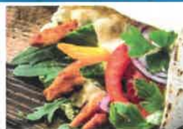
BBQ turkey wrap seasoned wedges coleslaw & cucumber sticks