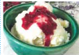
Frozen yogurt & raspberry puree