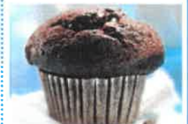
Chocolate & orange muffin