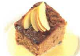
Ginger sponge & custard