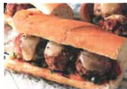
Meatball Marinara sub roll carrot & cucumber sticks